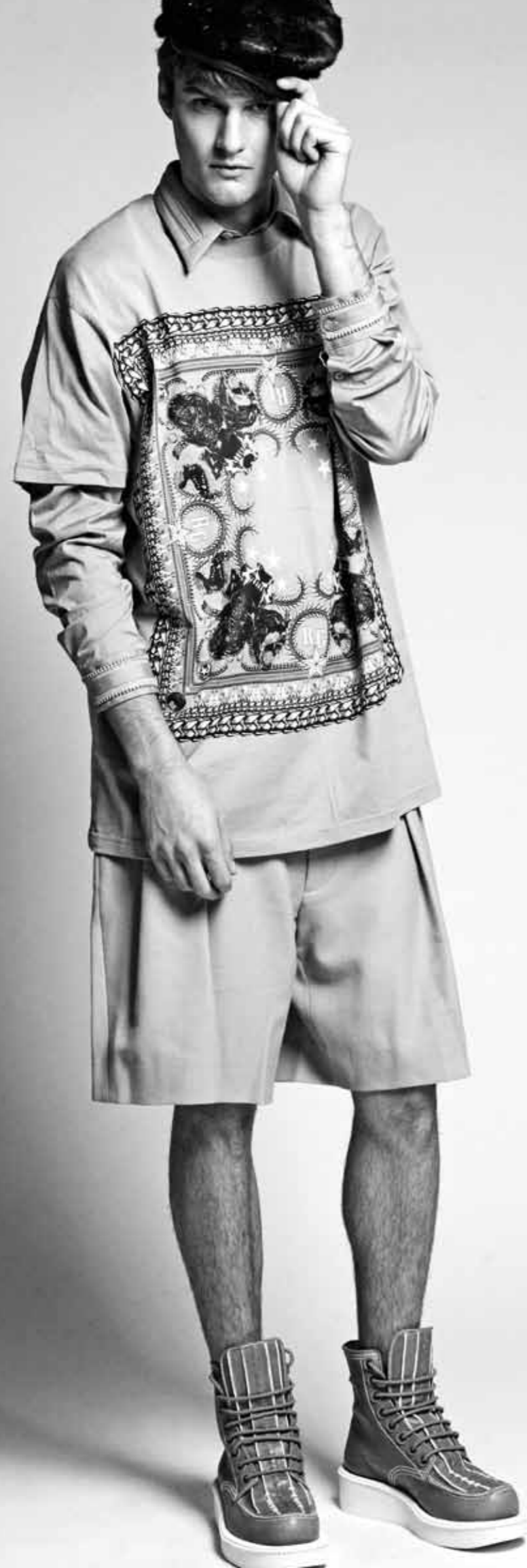
THE BERMUDA SHORTS Printed cotton T-shirt, cotton long-sleeved shirt, pleated front cotton bermuda shorts and hightop sneakers, all Givenchy.