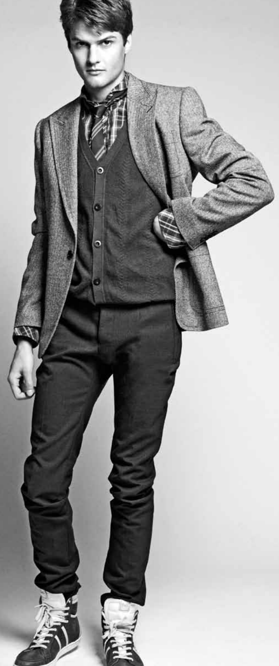
THE PREPPY JACKET Wool jacket, checkered cotton shirt, striped tie and hightop sneakers, all D&G. Knitted wool vest, Alfred Dunhill.