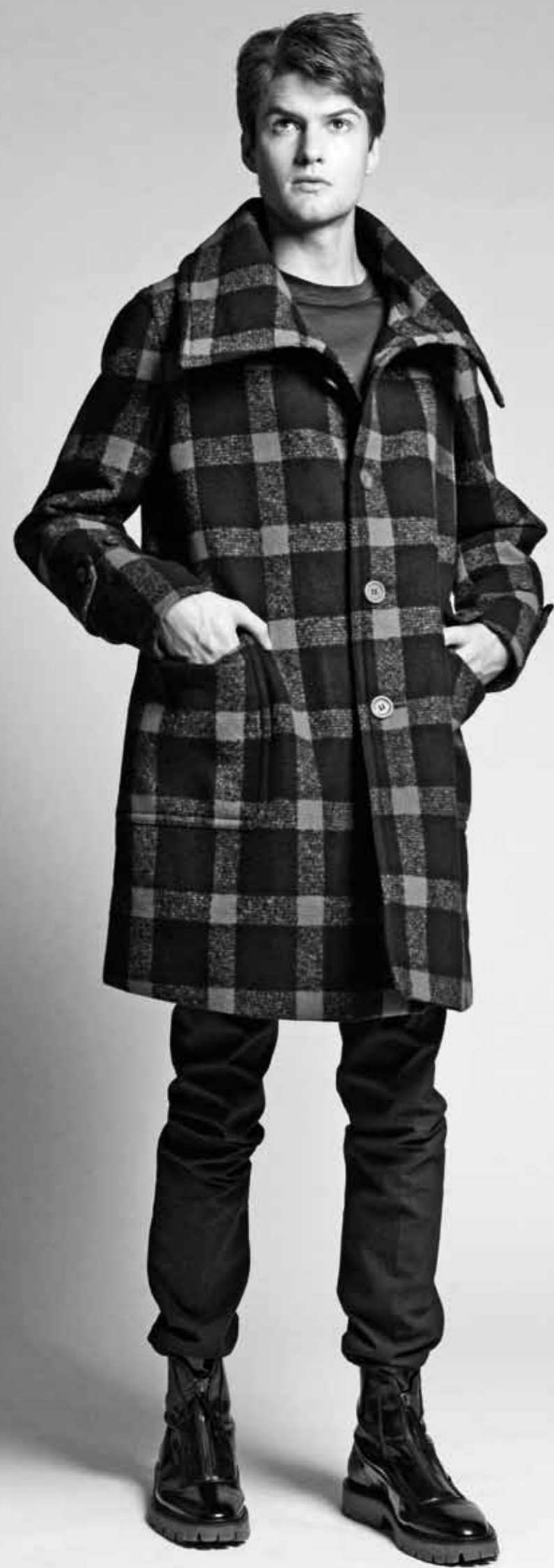
THE TRENCHCOAT Plaid wool trench coat, denim fitted pants and zip-up rubber boots, all Burberry. Cotton T-shirt, Hermès.