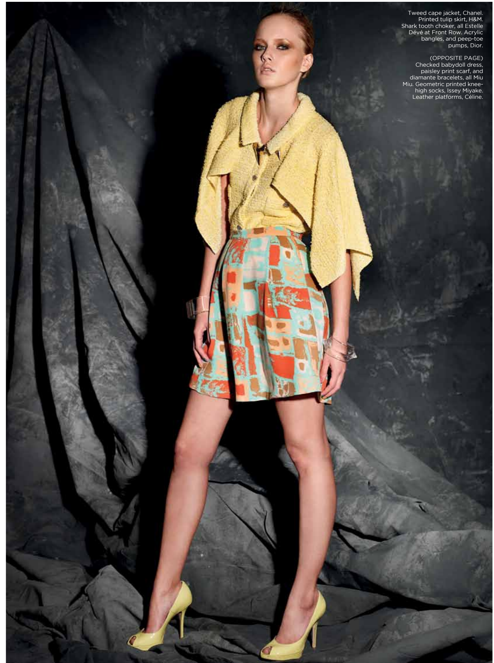
Tweed cape jacket, Chanel. Printed tulip skirt, H&M. Shark tooth choker, all Estelle Dévé at Front Row. Acrylic bangles, and peep-toe pumps, Dior. (OPPOSITE PAGE) Checked babydoll dress, paisley print scarf, and diamante bracelets, all Miu Miu. Geometric printed knee- high socks, Issey Miyake. Leather platforms, Céline.