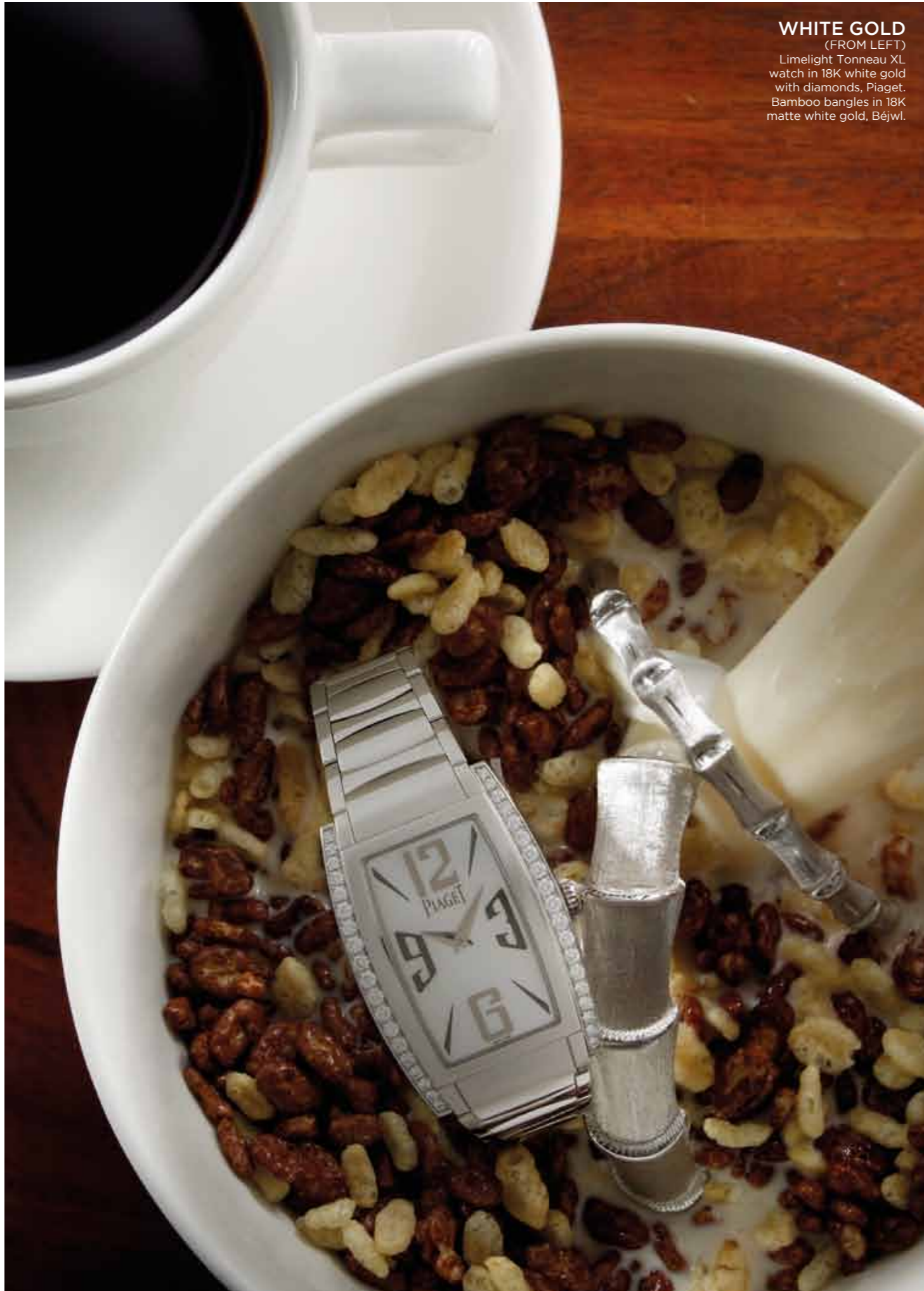
WHITE GOLD (FROM LEFT) Limelight Tonneau XL watch in 18K white gold with diamonds, Piaget. Bamboo bangles in 18K matte white gold, Béjwl.