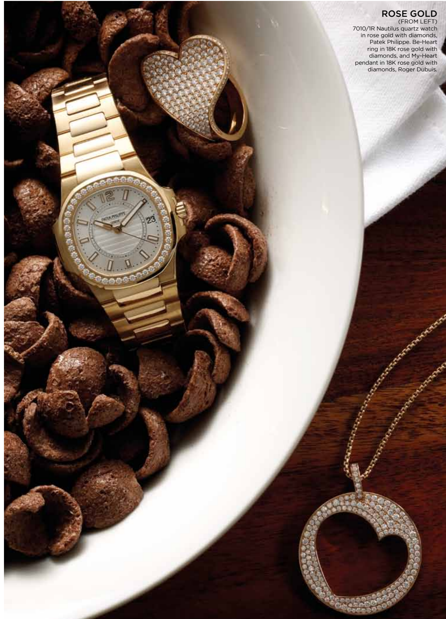
ROSE GOLD (FROM LEFT) 7010/1R Nautilus quartz watch in rose gold with diamonds, Patek Philippe. Be-Heart ring in 18K rose gold with diamonds, and My-Heart pendant in 18K rose gold with diamonds, Roger Dubuis.