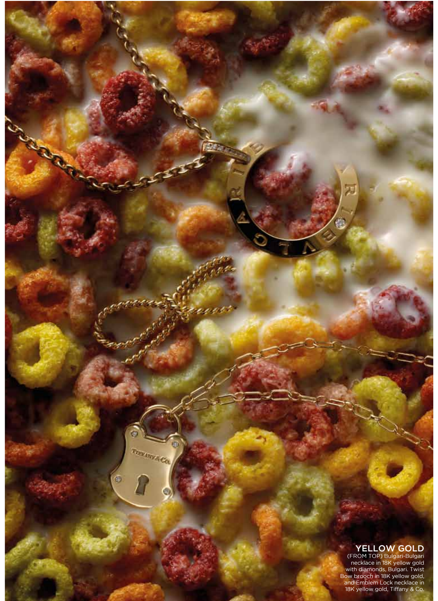
YELLOW GOLD (FROM TOP) Bulgari-Bulgari necklace in 18K yellow gold with diamonds, Bulgari. Twist Bow brooch in 18K yellow gold, and Emblem Lock necklace in 18K yellow gold, Tiffany & Co.