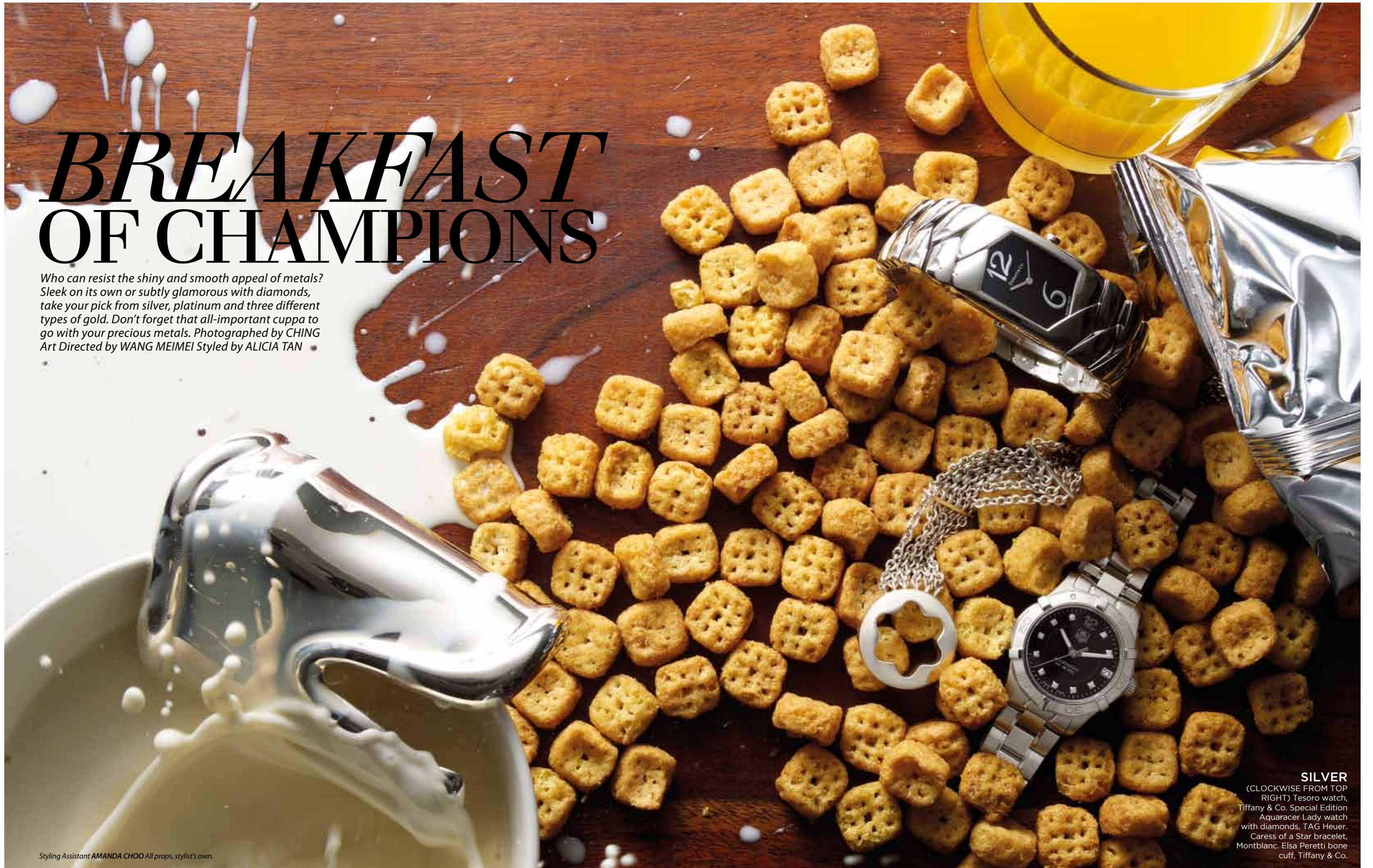
SILVER (CLOCKWISE FROM TOP RIGHT) Tesoro watch, Tiffany & Co. Special Edition Aquaracer Lady watch with diamonds, TAG Heuer, Caress of a Star bracelet, Montblanc, Elsa Peretti bone cuff, Tiffany & Co.